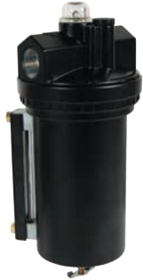
with metal bowl